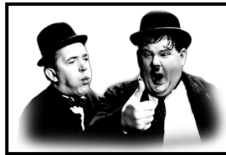
LAUREL & HARDY