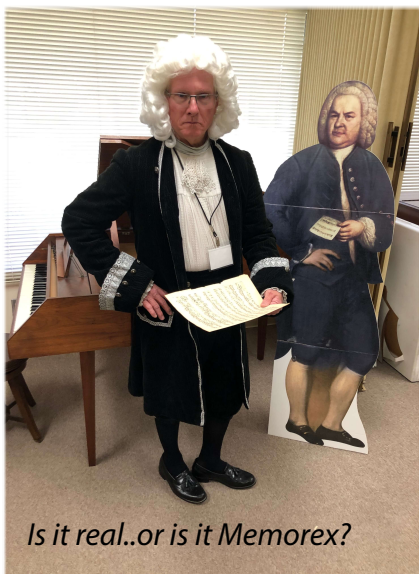
Is it real...or is it Memorex?