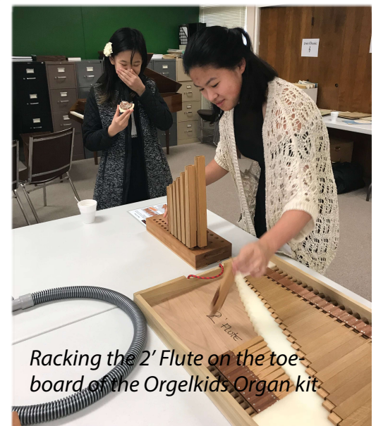
Racking the 2' Flute on the toe board of the Orgelkids Organ kit