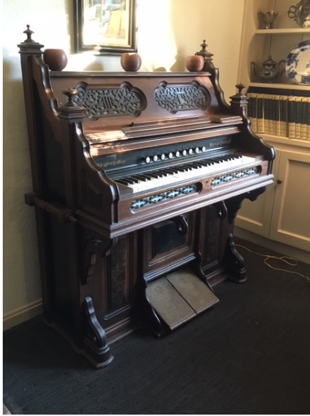
1900's Western Cottage Pump Organ