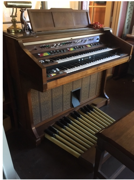
Yamaha Electone Model E-50