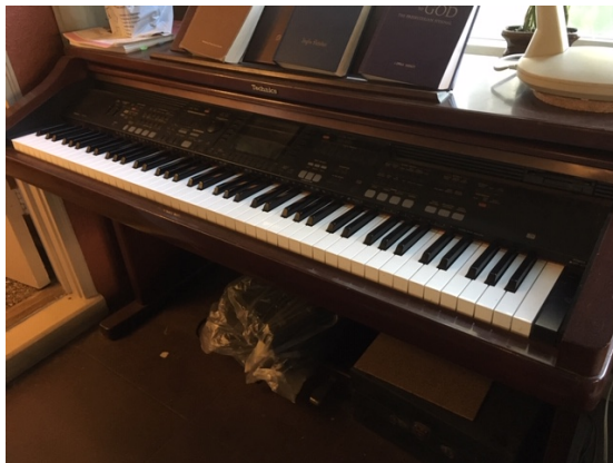
Technics SX-PR902 Electric Piano

Not Pictured: Roland MT120s Digital Sequencer