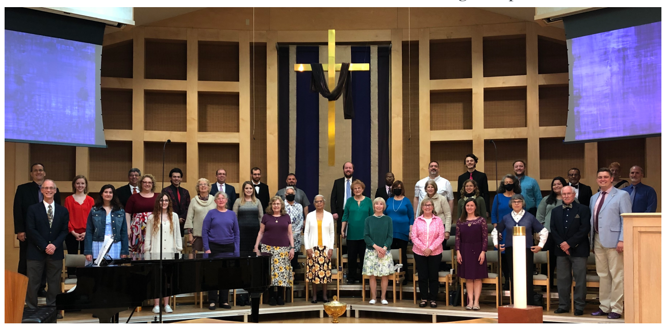
2022 Hymn Festival Choir, Accompanist and Organists